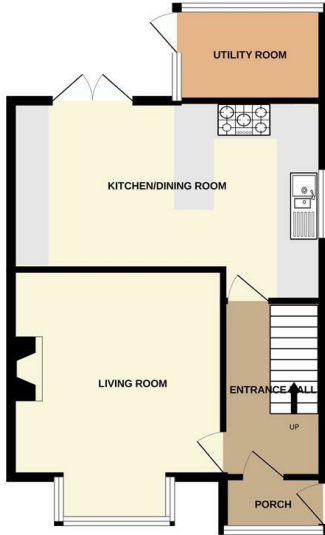
GROUND FLOOR 533 sq.ft. (49.5 sq.m.) approx.